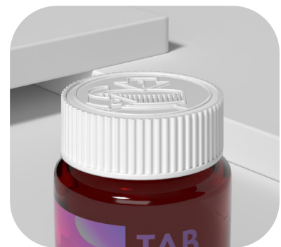
POLYPROPYLENE SCREW-ON CAP